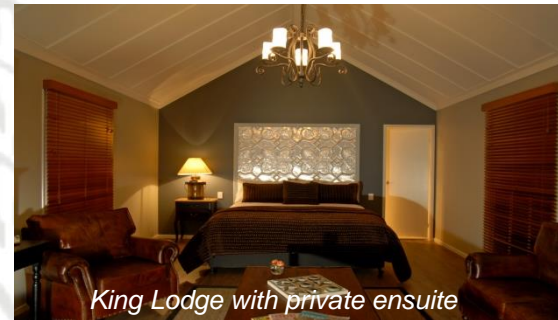
King Lodge with private ensuite

Current Room Rate per room per night Friday and Saturday $245 (Includes breakfast)