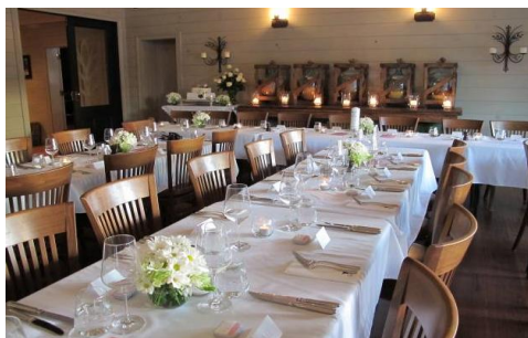
The Graze Function Room