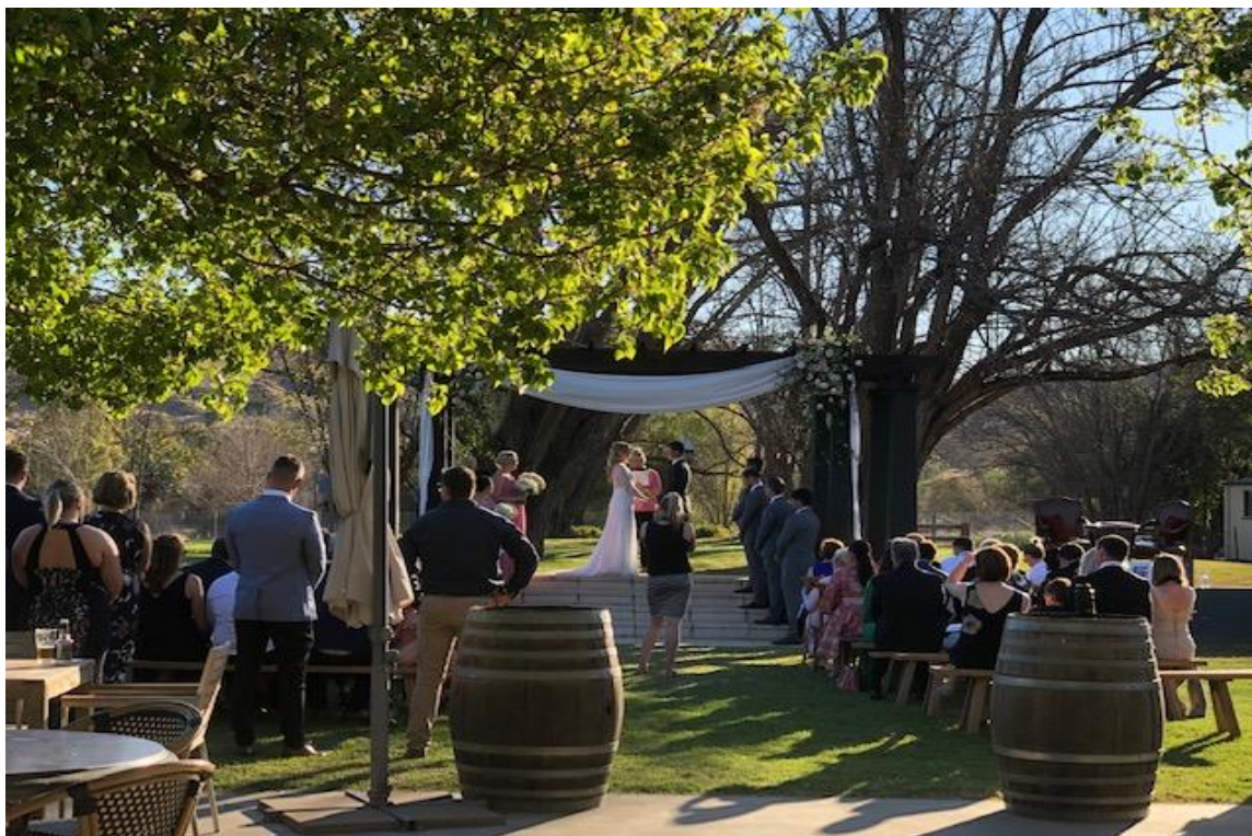
Garden Ceremony at the Willow Tree Inn

*Garden ceremonies to commence no earlier than 4pm