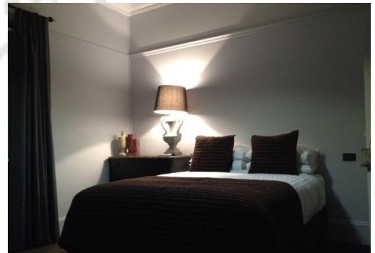
Pub Cottage Queen Room 9