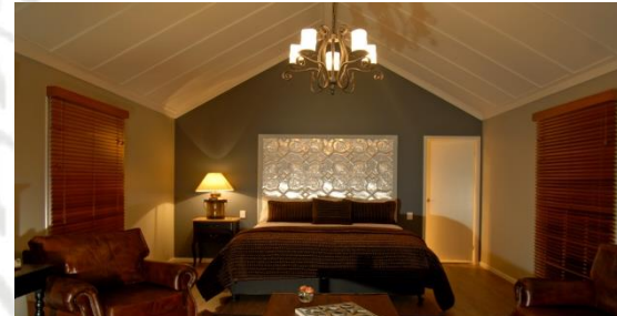
King Lodge with private ensuite