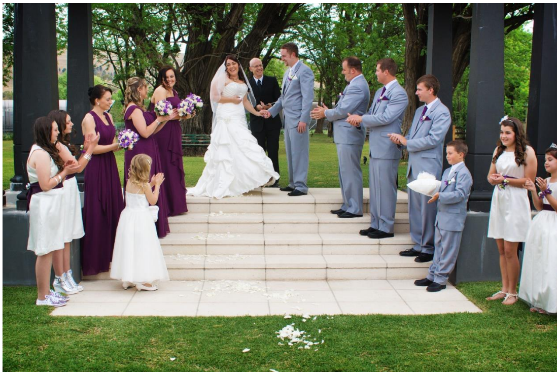
Garden Ceremony at the Willow Tree Inn

* Garden ceremonies to commence no earlier than 4pm