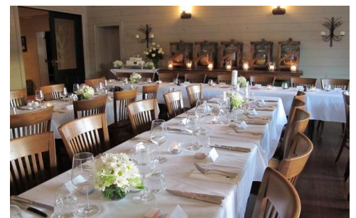
The Graze Function Room