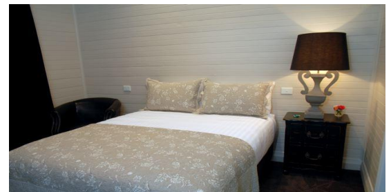
Hotel Queen Room with private ensuite